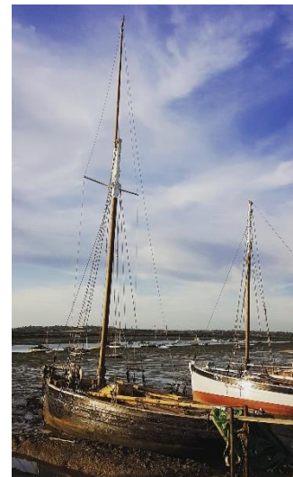
Saxonía in her West Mersea mud berth

My plan is to join Pioneer Trust and learn how to boat build, so when the time comes to rebuild Saxonía I will have more knowledge than I will ever have and that she will be completely saved. These old vessels are beautiful and can't be replaced.