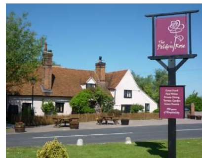
Now called The Peldon Rose

Mersea is an old English word - Meresig - meaning island of the pool. The smugglers got a lantern on the coast and swayed it back and forth to make it look like another boat nearer to the coast and thought that they could venture closer, it would be safe from rocks underwater but as soon as the boat got stuck on these rocks, the smugglers were good and ready to take over the boat. It was not just whisky that was to be had, it was silk, tobacco, anything that sold. The silk was used in people's coffins if not for the rich to purchase for clothing.