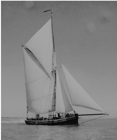
Saxonian on the Colne