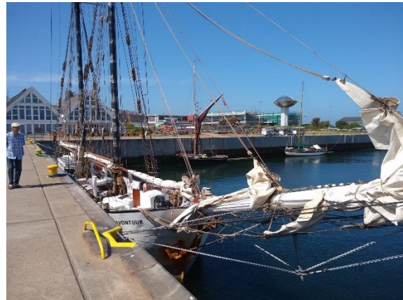
Bona at Heligoland

Bona and I have had some adventures. Two years ago, we made it onto the Rhine and very almost got to the German Border. Last year she chose to re-enact the plot from Riddle of The Sands, doing all the German Friesen Islands and spending a few days weather bound in Heligoland. Heligoland is famed for the largest TNT explosion ever set by man. After the war the royal engineers took it on themselves to destroy the German Submarine bases. On doing so they left a rather large hole in the island and reportedly the explosion could be heard from Oxford. Now the place is like Bicester shopping village is to the people of Oxford, the Germans visit for tax free cigarettes and alcohol along with discount designer wear, a very strange place indeed!