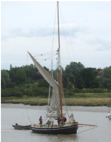
Saxonian passing Wivenhoe